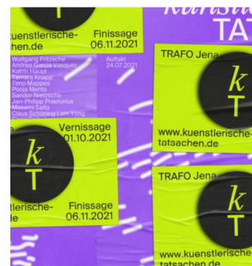
Illustration: Gabriel Dörner

Researchers gave insights into their work to artists, who created amazing artworks based on the exchange. The exhibition can be seen until the finissage on 6.11.