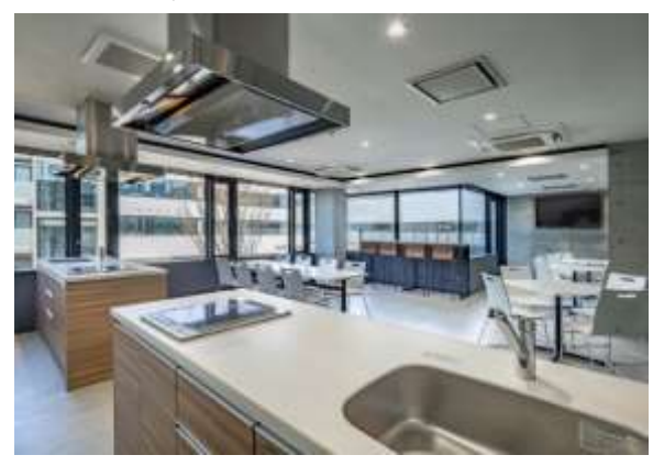
Shared Living / 共有リビング