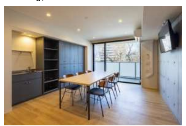
5. Dormy Nishi-Kasai 3 / ドーミー西葛西 3