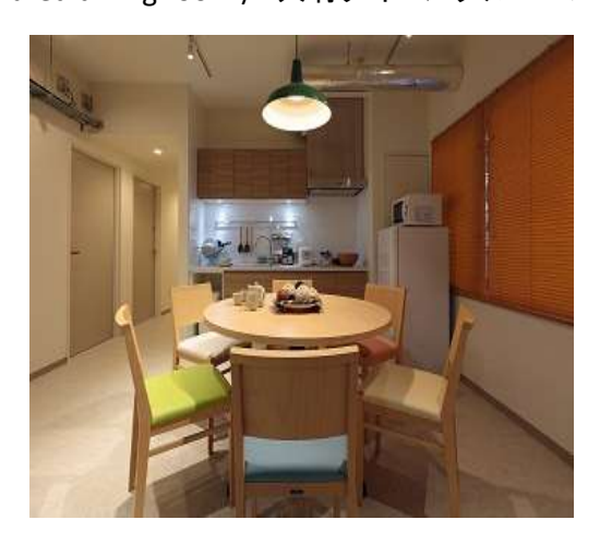
Shared dining room / 共有ダイニングルーム