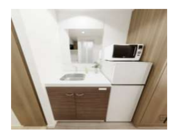
4. Meiji Global Village / 明治大学グローバル・ヴィレッジ