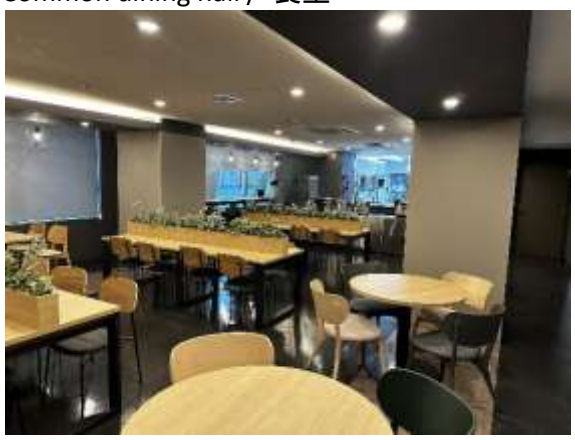
Common dining hall / 食堂