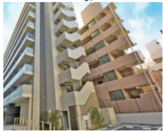
Exterior of the building /外観