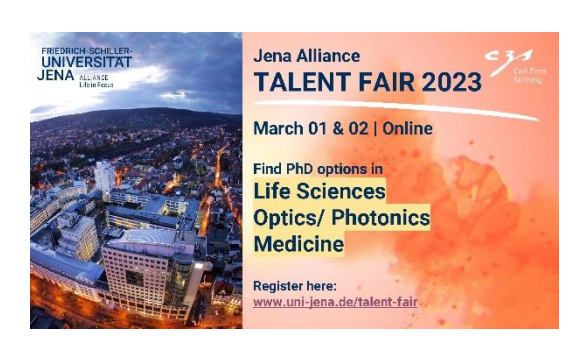
Illustration: Franziska Eberl

Funding: up to 25.000 € Deadline: 31.03.2023 Information: LIFE-Funds