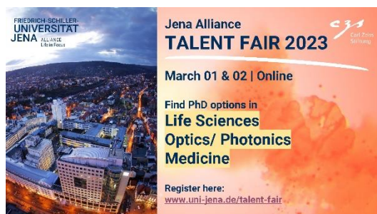
Illustration: Franziska Eberl